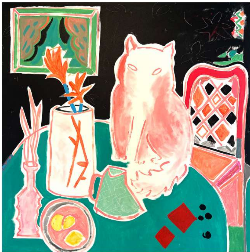
HOT SHADOW / 2023 Acrylic on canvas 66x66 in