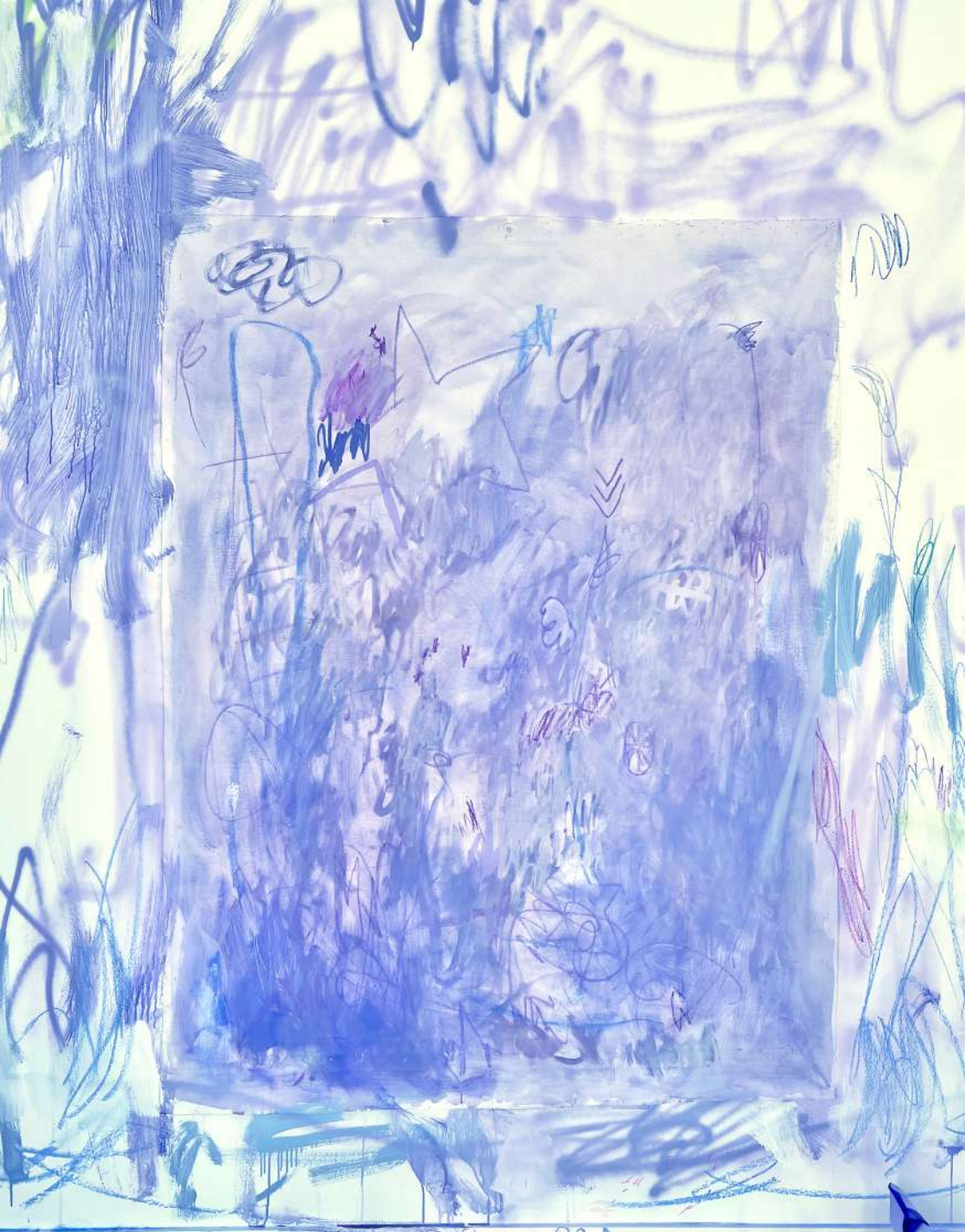
LAVENDER / 2023 Acrylic on canvas 77,5x58,5 in