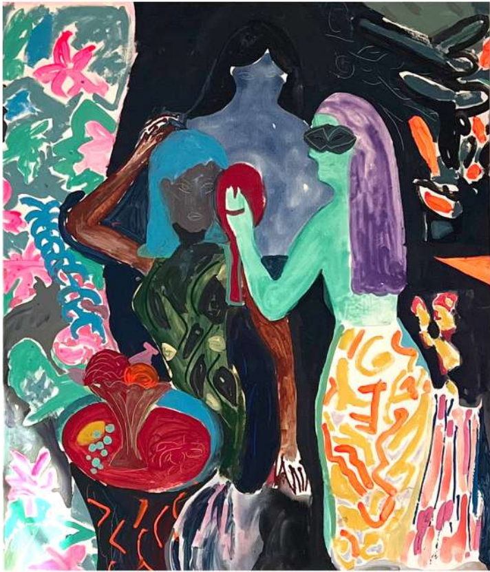
VANITY / 2023 Acrylic on canvas 76,5x85,5 in