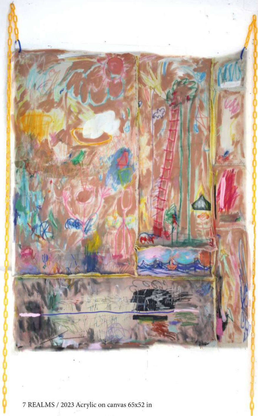
7 REALMS / 2023 Acrylic on canvas 65x52 in