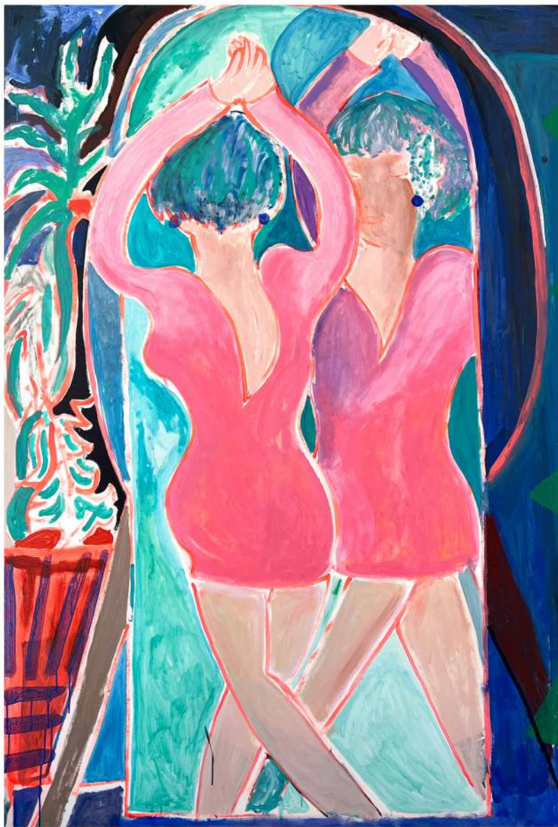
MIRROR / 2023 Acrylic on canvas 77x52 in