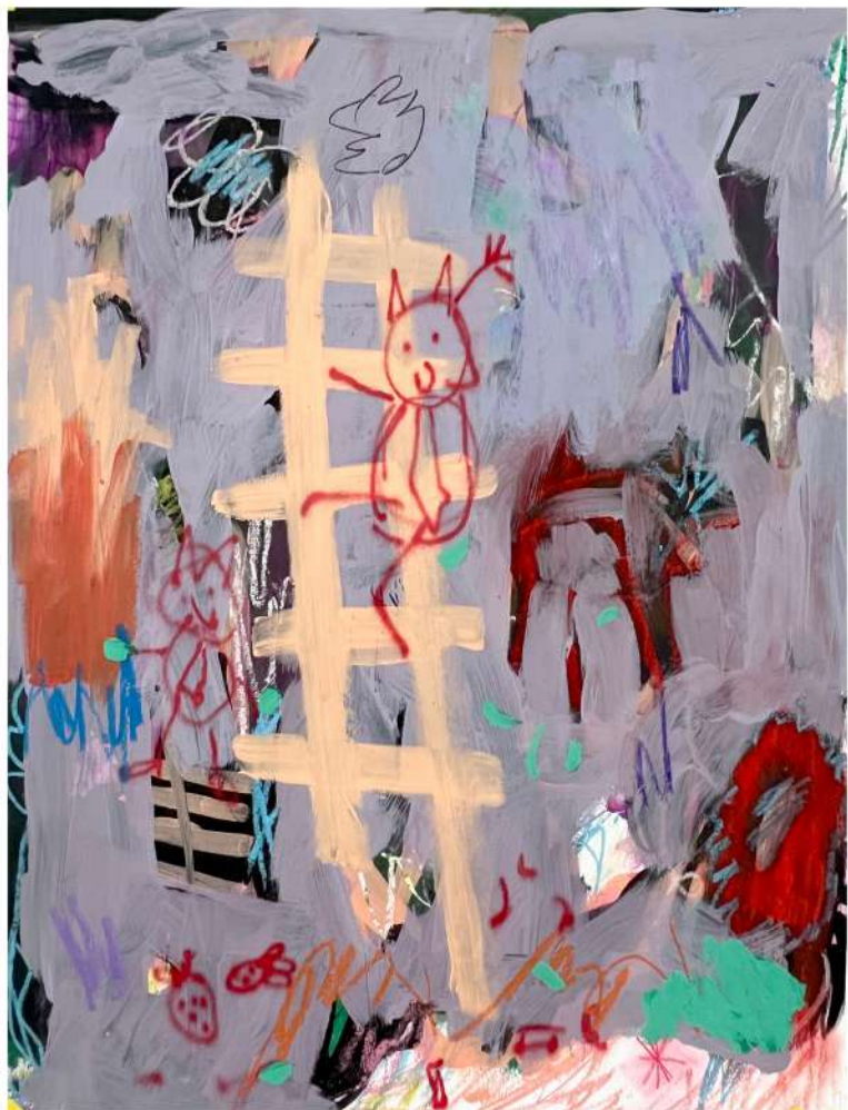
ART DEALERS FROM HELL / 2023 Mix media on paper 24x18 in