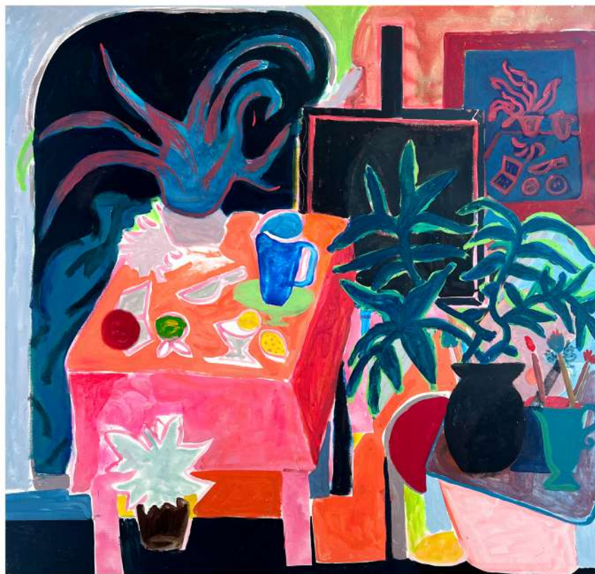
STUDIO / 2023 Acrylic on canvas 75x78 in