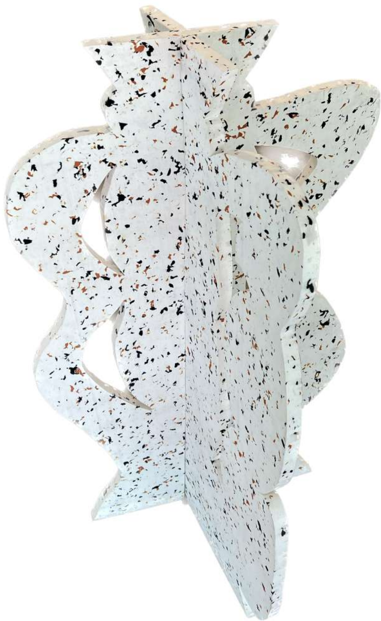
VASE / 2022 Rubber 51,5x38 in