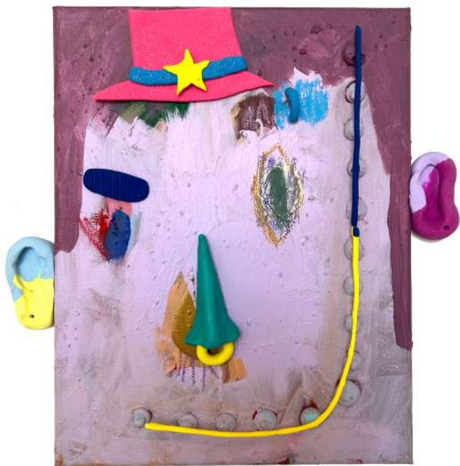
BOBBY / 2022 Mix media on canvas 14x15 in