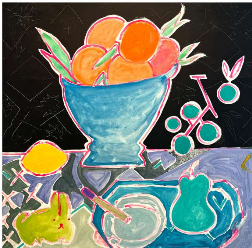
LARGE BOWL OF FRUITS / 2023 Acrylic on canvas 78x79 in