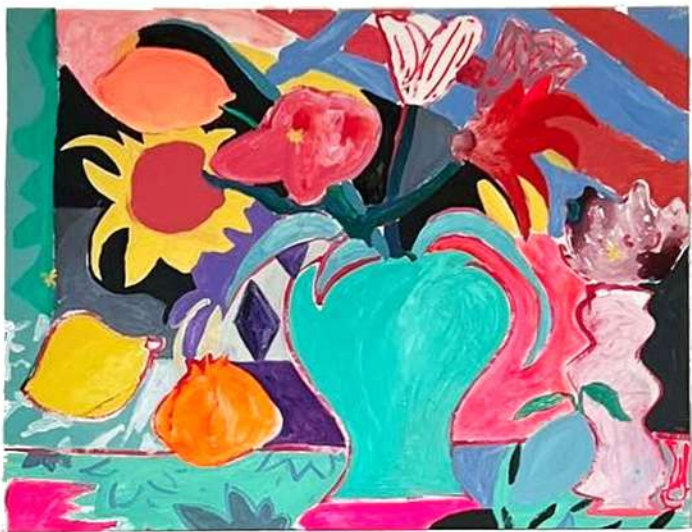
ARLES / 2023 Acrylic on canvas 79x60 in