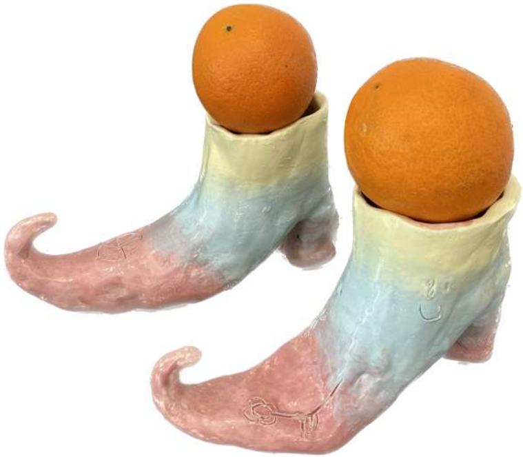
WHIMSY BOOTS / 2023 ceramic 8x5 in