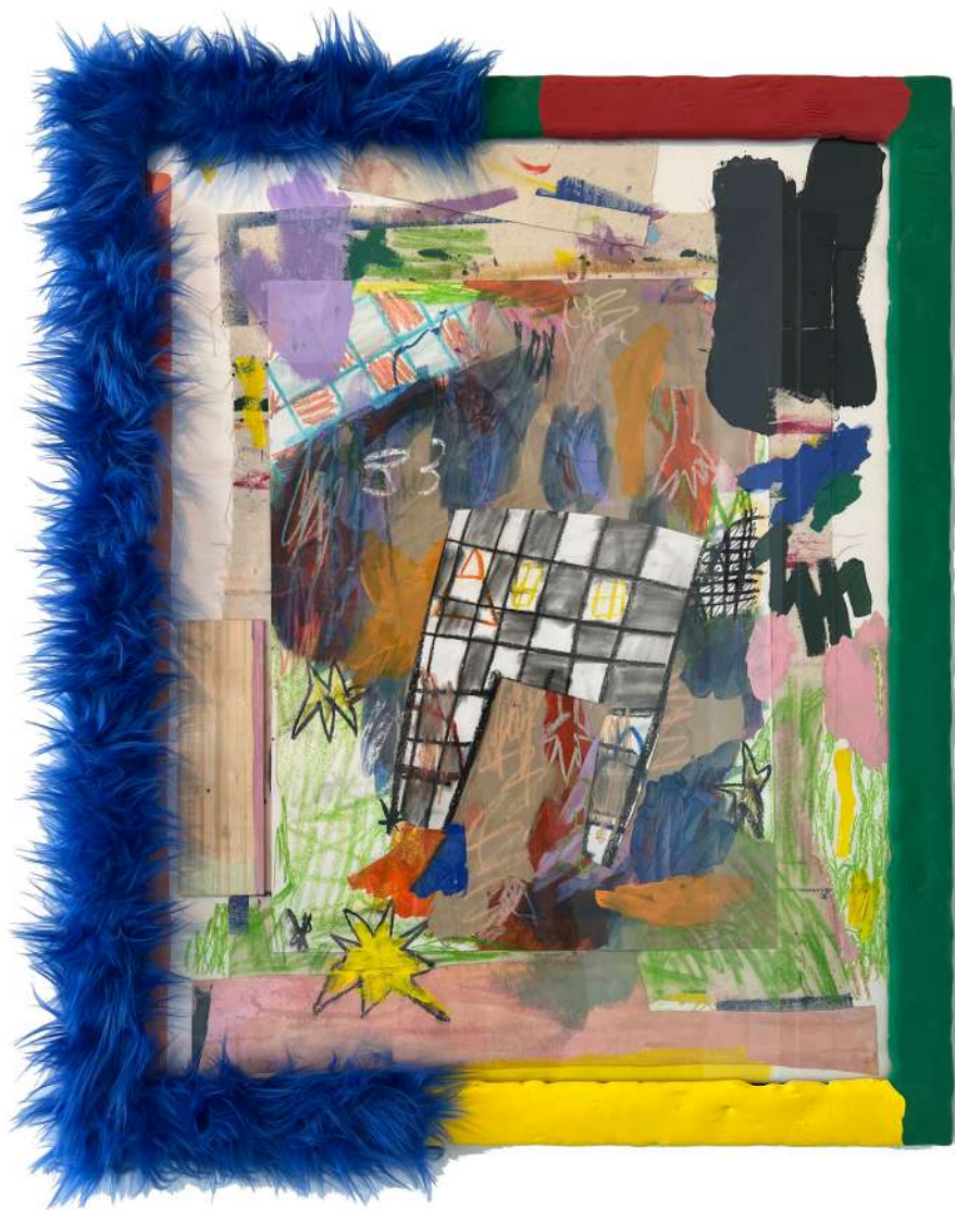
DR SUESS / 2023 Mix media on paper 37,5x31 in