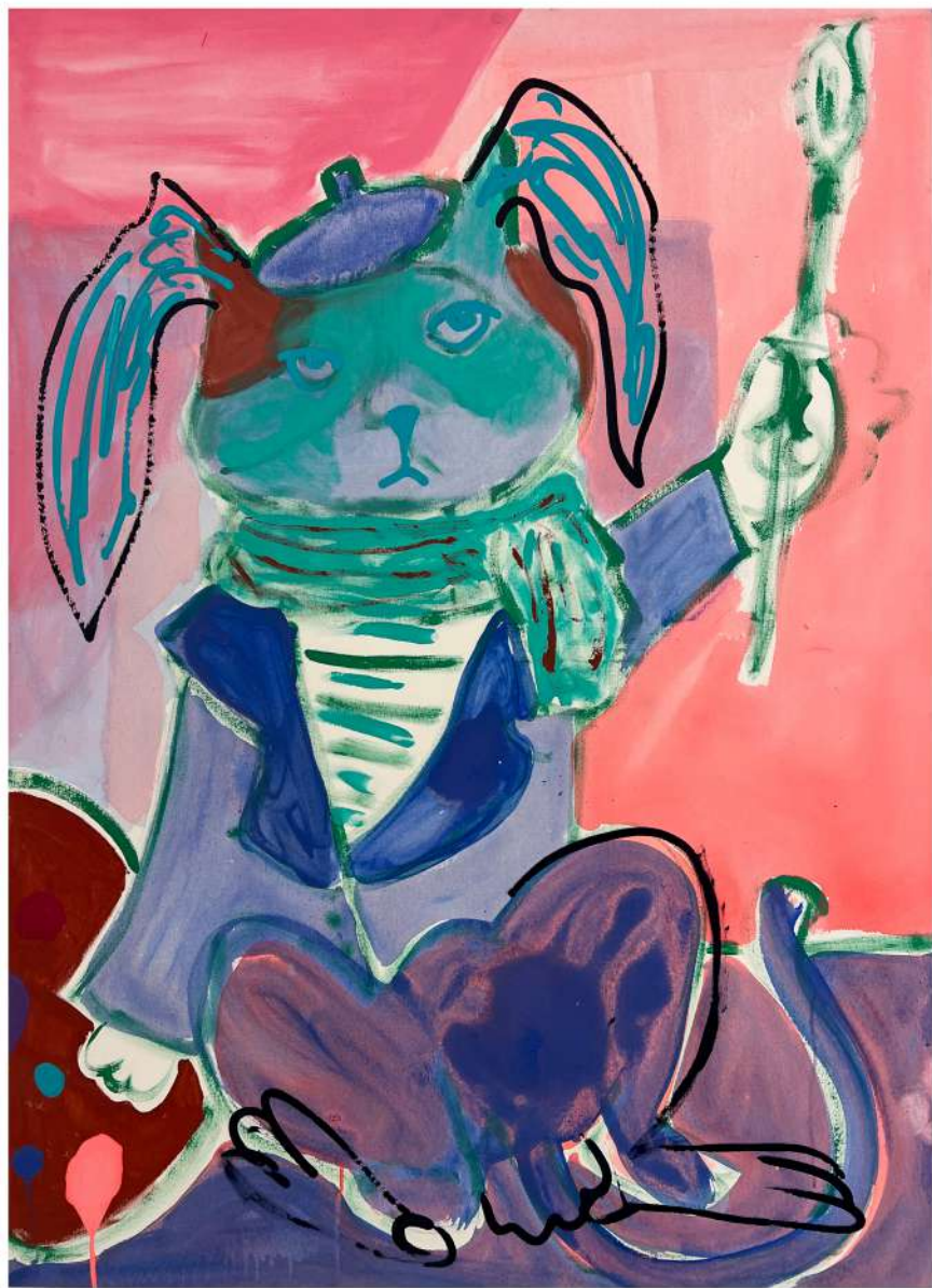
NOT EVERYTHING ITS FUN AND EASY / 2023 Acrylic on canvas 46x33,5 in