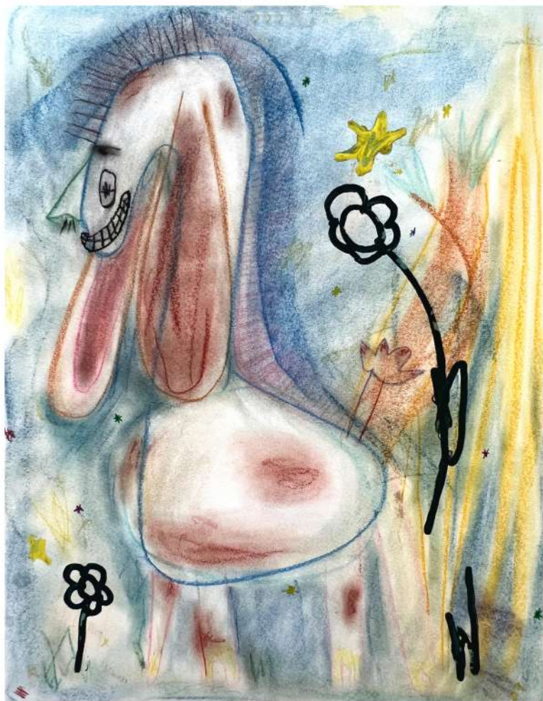
CLYDE / 2023 Mix media on paper 24x18 in