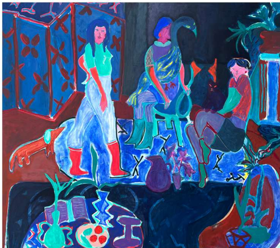
SHIFT / 2023 Acrylic on canva 76,5x85,5 in