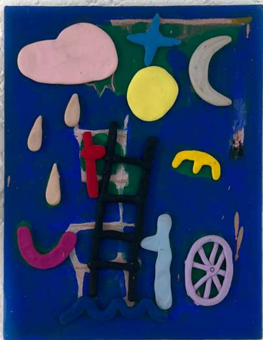
IM HOME MOM / 2023 Acrylic charcoal pastel clay on canvas 14x11 in