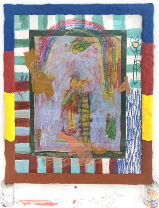
ART IS HARD / 2023 Mix media on paper 37,5x31 in