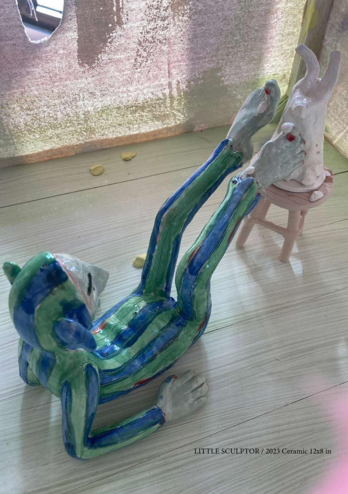
LITTLE SCULPTOR / 2023 Ceramic 12x8 in