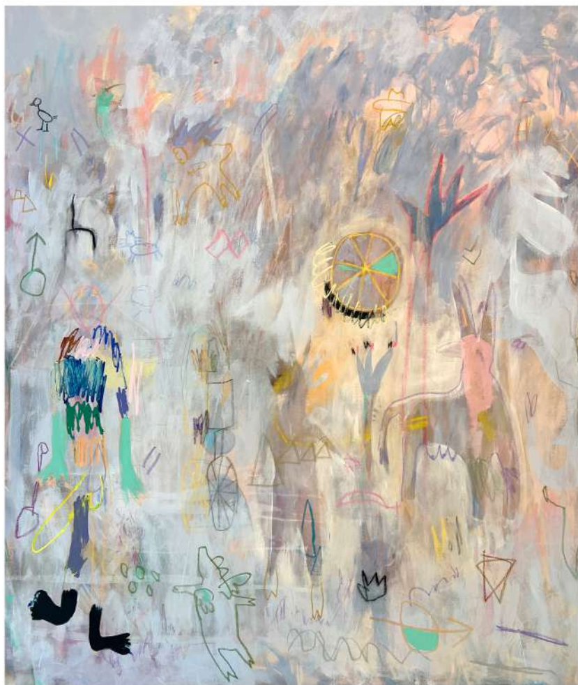
PIGS CAN FLY / 2023 Acrylic on canvas 75x65 in