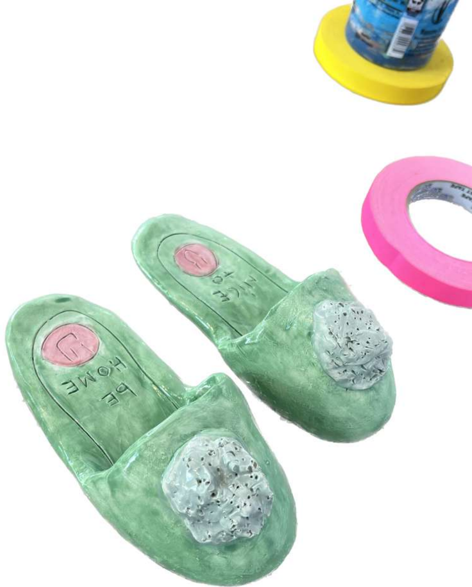
HOME SLIPPERS / 2023 Ceramic 8x4 in